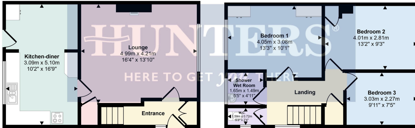
Ground Floor Approx 42 sq m / 455 sq ft

Approx Gross Internal Area 85 sq m / 912 sq ft